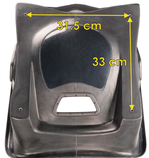
Holes spacings for the optional W2 back frame

Weight 2.33 kg without backframe, 3.95 kg with backframe. Weights quoted are + or - 10%