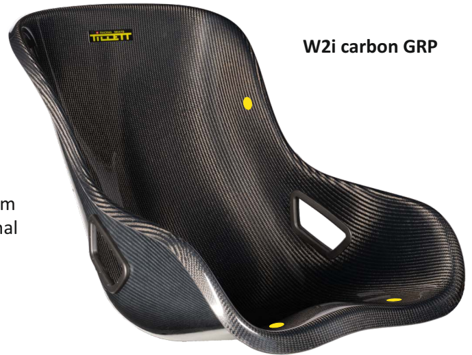
W2i carbon GRP

The picture above shows the W2i carbon GRP shell without the back frame. When used without a back frame, at least four mount points are advised in the areas shown. It is advisable to use our TK1 bolt kit, or the low profile TLPK1 stainless fitting kit. Aluminum plates between the upper mount points are also advised and the brackets should be parallel to the composite profile at the bolting points.