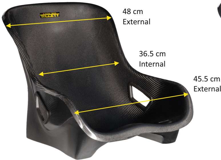
W2i carbon GRP with back frame.

The W2i Tillett car seat is the wide version of the W1i and is designed for drivers over 100 kg. The W2i is either supplied as a single skin shell, or with a moulded composite back frame which makes the seat self supporting. If the single skin type is used, it must have brackets made in order to fit it to various vehicles. These seats are available in gloss GRP or with a carbon front surface. The W2i has a Dinamica suede panel set option where the trim and padding can be customised. Seat belt harness holes are fitted as standard.