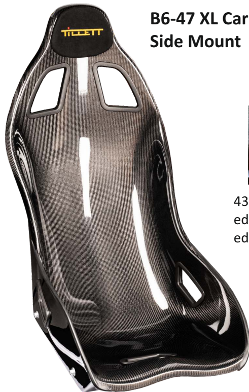
B6-47 XL Carbon GRP Side Mount