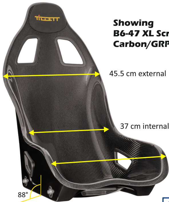
Showing B6-47 XL Screamer Carbon/GRP

B6 XL Screamer seats are matched to bracket sets PTBi, PTBO, TBFIA, STBi, STBO, and Elise brackets EBR, EBR 17+, EBS, EBP. These brackets have a 2° from vertical angle, which matches the side of the seat. Brackets which do not match this angle will unduly stress the composite.