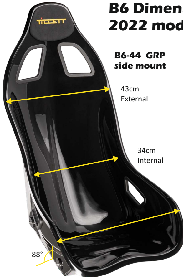
B6-44 GRP side mount